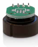
▶ SPS 1000 Z